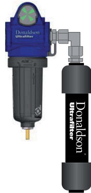
VarioDry SPN vertical installation